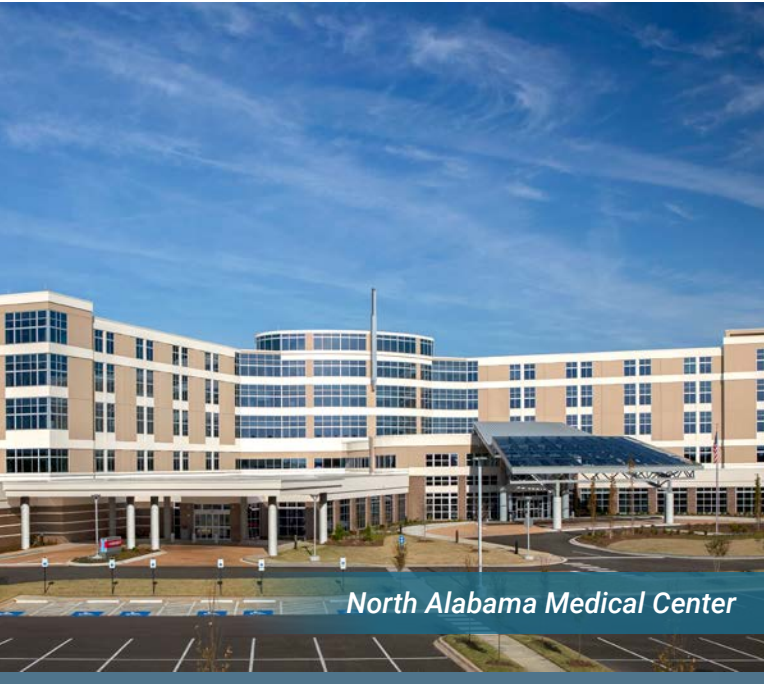
North Alabama Medical Center

North Alabama Medical Center/Shoals Hospital's mission of making communities healthier ® is at the heart of everything we do. It is deeply embedded in how we provide high-quality care for patients, expand and enhance our services, and make meaningful investments to promote the health and economic growth of our region.