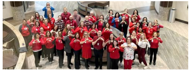
North Alabama Medical Center team members proudly wore red in support of Women's Heart Health Day.