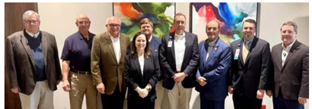
A group of local lawmakers met with North Alabama Medical Center and Shoals Hospital leaders to discuss the legislative hurdles facing healthcare concerns in the Shoals communities.